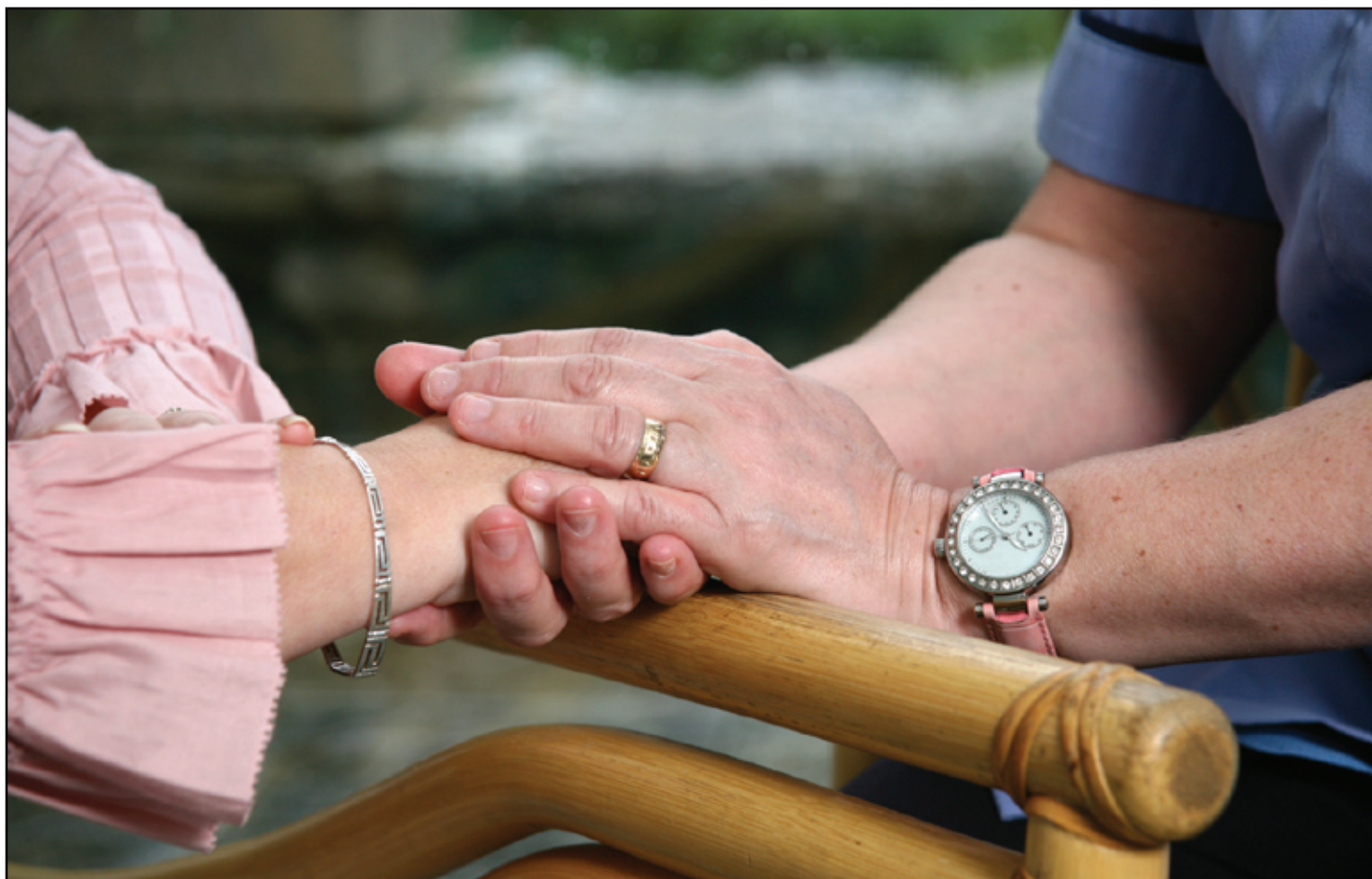
BLUE RIDGE HEALTHCARE